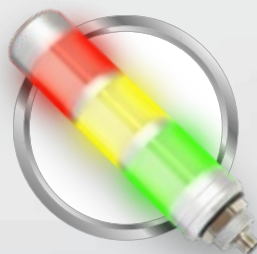
IO-Link LED Stack Lights