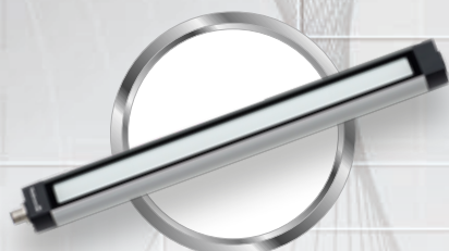
Linear LED Machine Lights