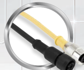
Sensor Cables - 4, 5, 8-pin