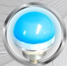
IO-Link LED Dome Lights