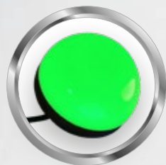
Multi-Colored LED Dome Lights