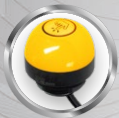
Colored LED Touch Buttons