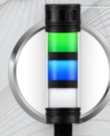
Signal Tower Lights