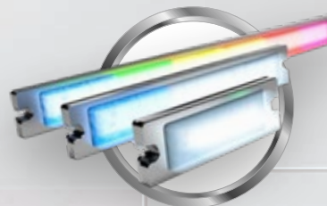
IO-Link LED Machine Lights