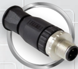
Field Connectors - 4, 5, 8-pin