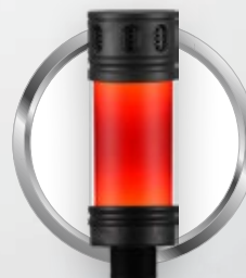
Signal Column Lights