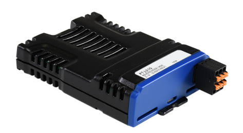
PTi210 SM-EZMotion Module