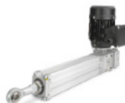
PRECISION LINEAR ACTUATORS