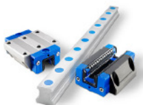
PROFILE RAIL BEARINGS & GUIDES